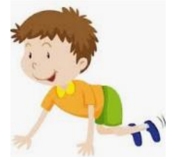
marching frog jumps slide on tummy crawl