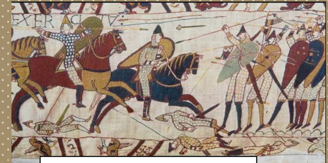
The Bayeux Tapestry