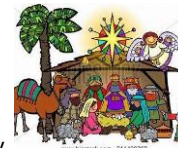
The Christmas story